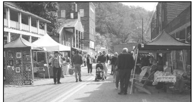
The first "Madison Celebrates Art" Festival held in Marshall.

July 2003 – Welcome Center: Display cases will feature art and crafts from Handmade in America. Tourism related brochures and videos are needed. Commissioner's Meeting: Madison County did not purchase 88 acres of land offered for sale. The land could be used for Plow Day, as well as be a permanent location for the local Farmers Market.